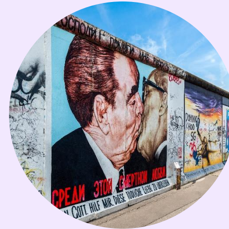
EAST SIDE GALLERY

This is one of the most iconic sights in the city. The monument has over 200 years of history. During the cold war, it symbolized division; when the Berlin Wall fell, it became a symbol of German unity.